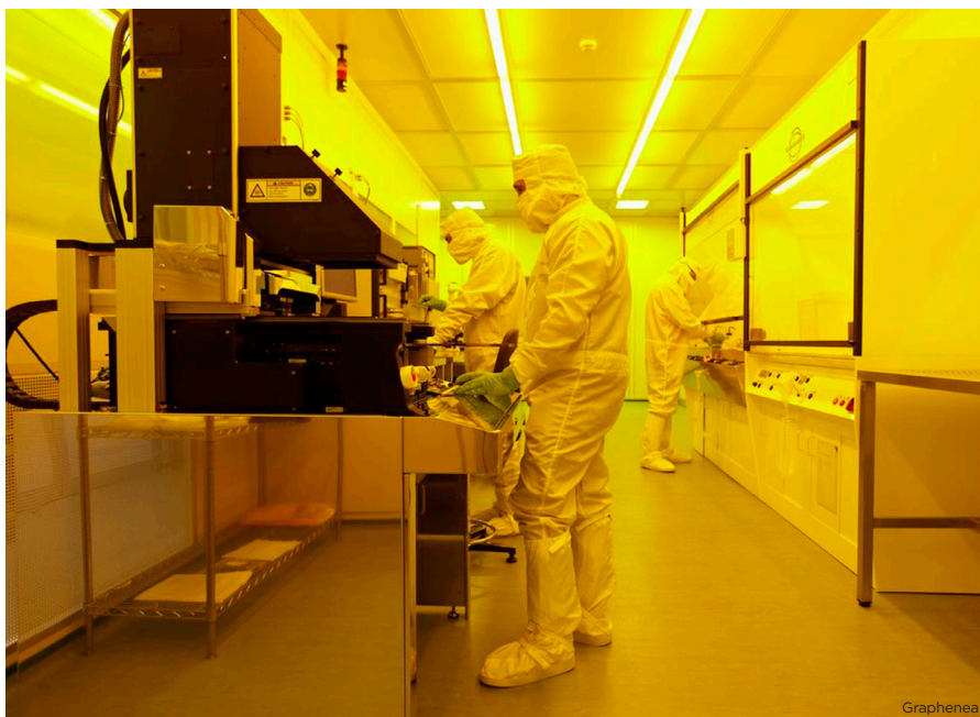
Billions of dollars are being ploughed into graphene research in university and commercial laboratories around the world.

Physical methods of isolating graphene, such as mechanical exfoliation, or the so-called