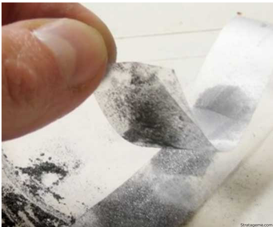
Mechanical exfoliation or 'scotch tape' methods are capable of producing pristine graphene in small quantities but are not scalable.

institutions worldwide, and are finding commercial applications in inks, sensors, energy storage, photovoltaics, composites, paints and coatings.