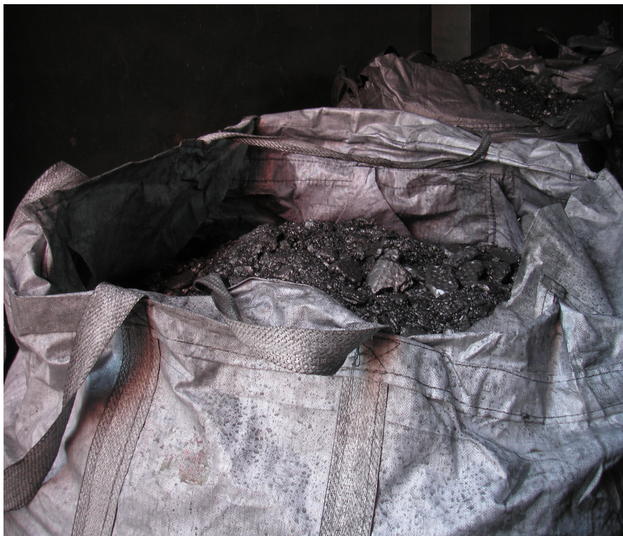
Bags of potential: natural flake graphite could emerge as the raw material of choice for future graphene production.

"With our process, most impurities can be tolerated, up to a level of 5% or so, because they are separated from the graphene together with other wastes," Wendelbo notes.